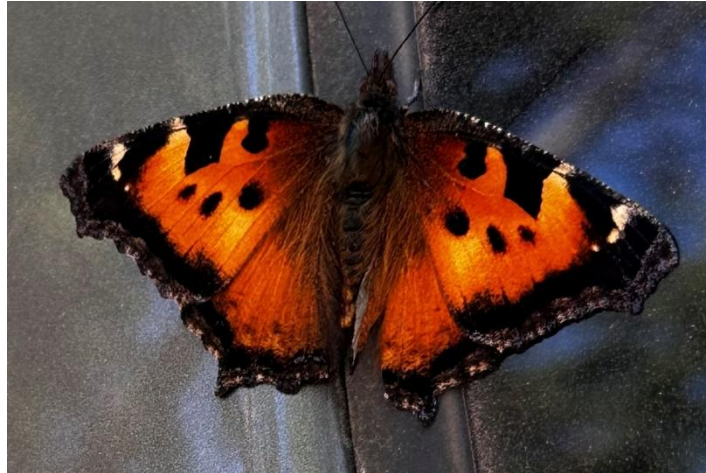
We saw clouds of the California Tortoiseshell Butterfly, Nymphalis californica

Traditionally tended by the Tenino, Molalla, Cayuse, Umatilla and Walla Walla, currently considered the Confederated Tribes of Grand Ronde, Siletz Indians, and Warm Springs.